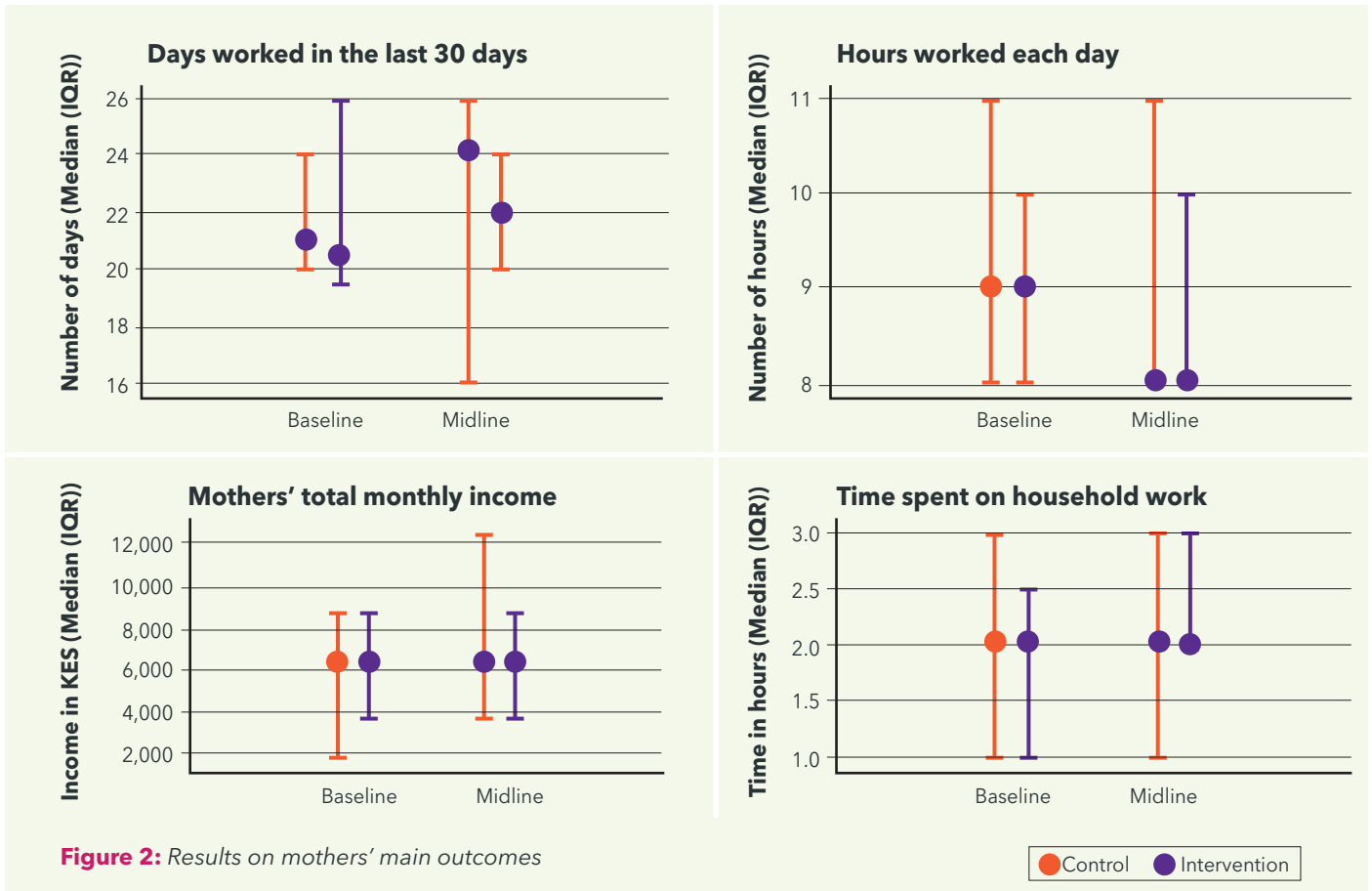
Figure 2: Results on mothers' main outcomes

Some mothers reported that fathers provided support by taking care of children and feeding them. However, the level of male involvement in childcare activities was quite low.